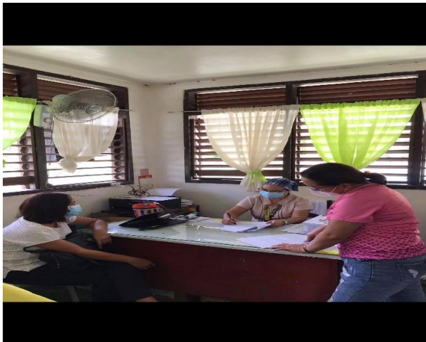
Visit to Proposed Satellite Members 11 May 2021