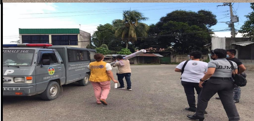
Turn-over of floor mat for Tagum City Jail-Female Dorm 28 May 2021